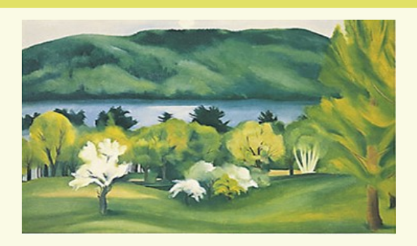
Lake George Early Spring, by Georgia O'Keeffe