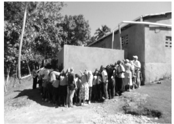
Laying hands on the new cistern as we dedicate it to the Lord's service

This option is not available for many in Haiti. Or other "third world" nations. They drink from polluted streams Or from water scooped from some place That I would not even consider touching.